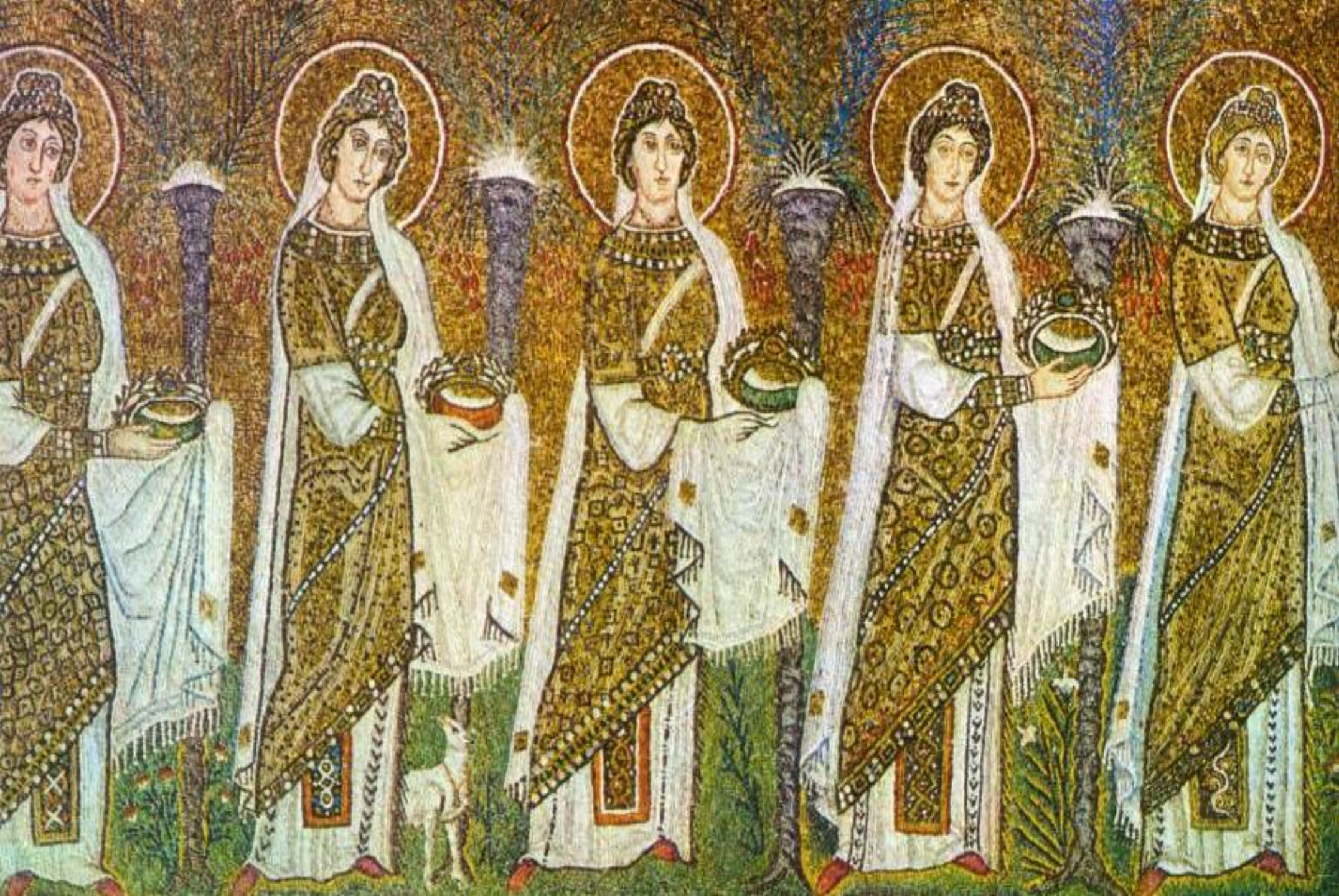
6 th -Century Mosaics of female martyrs in the Church of Sant' Apollinare Nuovo Italy