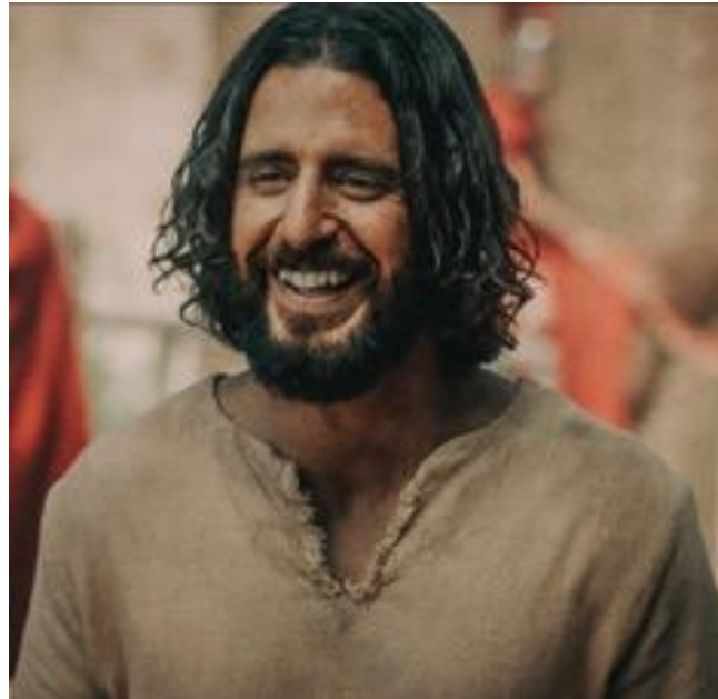
The Chosen TV series